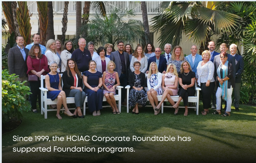
Since 1999, the HCIAC Corporate Roundtable has supported Foundation programs.