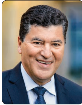
Elias A. Zerhouni, MD Sunday, November 26 at 8:30 AM Opening Plenary Session: "Imaging Innovation in 21st Century Biomedicine: Challenges and Opportunities"