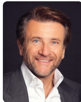
Robert Herjavec from Shark Tank on Thursday, November 30 at 2 PM Plenary Speaker: "Fast Forward and Focused"